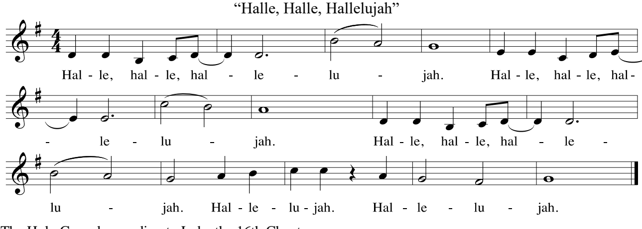
The Holy Gospel according to Luke the 16th Chapter Glory to you, O Lord.