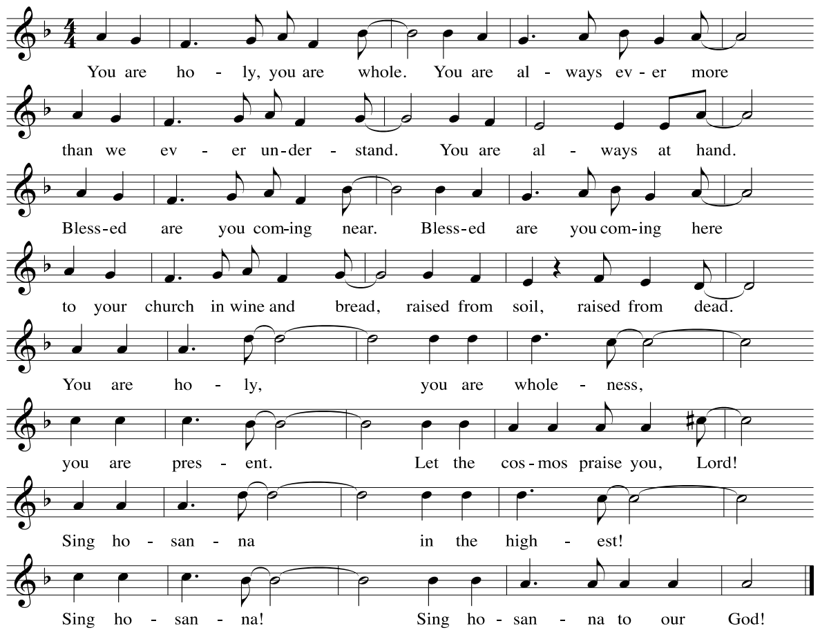
THANKSGIVING AT THE TABLE